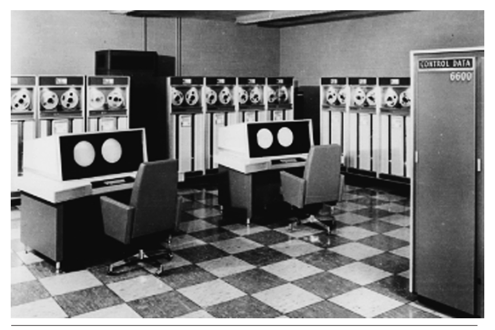
FIGURE 4.16.2 The CDC 6600, the first supercomputer.

The internal organization of the 360/91 shares many features with the Pentium III and Pentium 4, as well as with several other microprocessors. One major