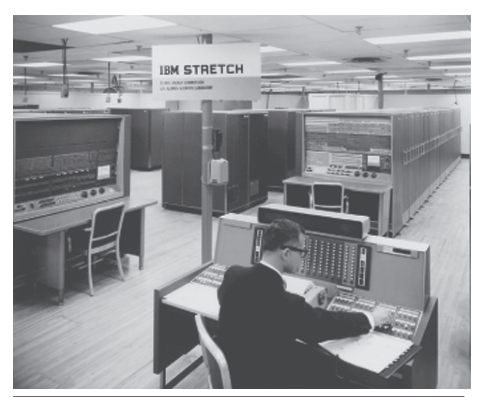
FIGURE 4.16.1 The Stretch computer, one of the first pipelined computers.

It is generally agreed that one of the first general-purpose pipelined computers was Stretch, the IBM 7030 (Figure 4.16.1). Stretch followed the IBM 704 and had a goal of being 100 times faster than the 704. The goals were a "stretch" of the state of the art at that time—hence the nickname. The plan was to obtain a factor of 1.6 from overlapping fetch, decode, and execute by using a four-stage pipeline. Apparently, the rest was to come from much more hardware and faster logic. Stretch was also a training ground for both the architects of the IBM 360, Gerrit Blaauw and Fred Brooks, Jr., and the architect of the IBM RS/6000, John Cocke.